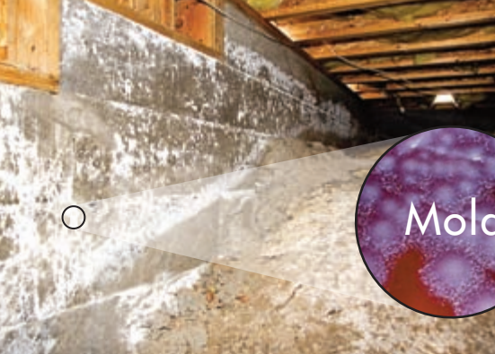
Typical crawl space under home with mold growth