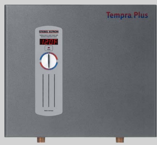
Tempra® Plus 12-36