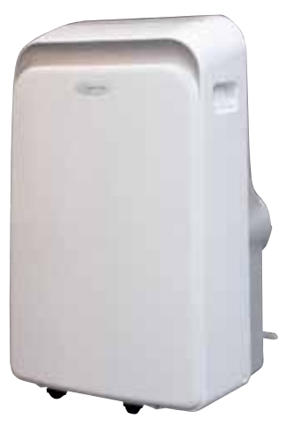
PSH-141A 14,000 BTUH Nominal