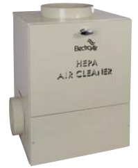
Whole-House True HEPA

For the ultimate clean air combination, combine one of these Air Cleaners with the HEPA system.