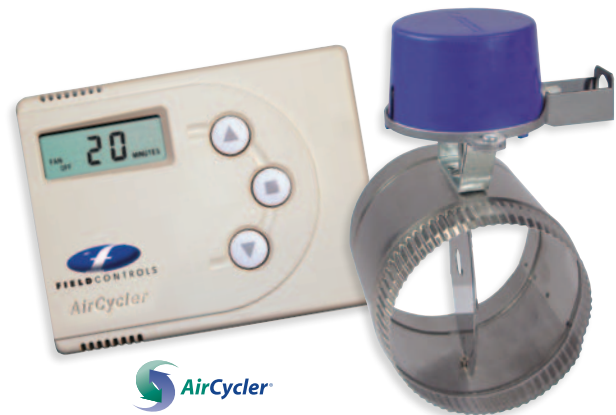
The Fresh Air System