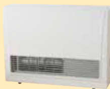
EX22C / EX22CW (EX22CW shown) (ideal output for mid to larger-sized areas)