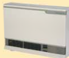
ES38 (ideal output for mid to larger-sized areas)