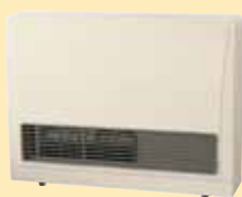
EX17C (ideal output for mid-sized areas)