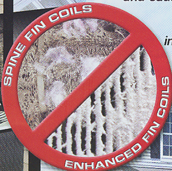
Close up of Dirty Fins

This means decreased equipment life with increased maintenance, repair and operating costs.