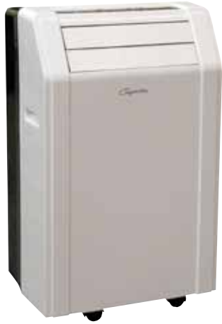
PS-101A 10,000 BTUH Nominal