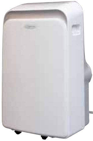
PSH-141A 14,000 BTUH Nominal