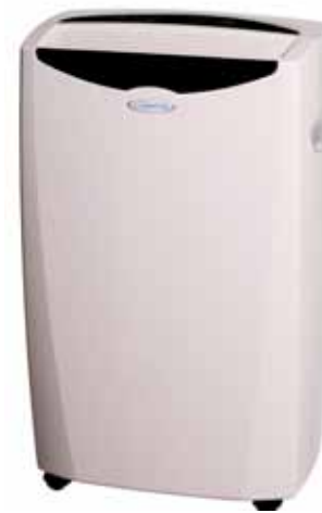
PD-121B 12,000 BTUH Nominal