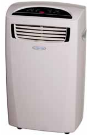
PS-91B 9,000 BTUH Nominal