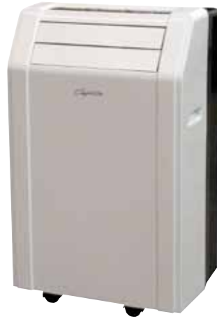
PS-81A 8,000 BTUH Nominal