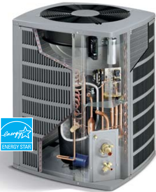
U.S. Average Five-Year Electric Cumulative Energy Savings for High-Efficiency 18 SEER Air Conditioners and Heat Pumps vs. 10 SEER**

Swept-wing fan blades reduce turbulence and deliver whisper-quiet performance