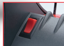
Blower Fan Power On/Off Switch