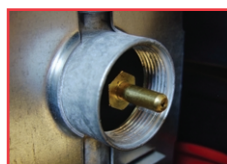
Features Built-In Thermal Protection Probe

Model No. MH18 Stock No. F274800 4,000/9,000/18,000 BTU/HR Gas: Propane Operating Position: Vertical Valve Position: Pilot, Lo, Med. & Hi Heating Time: One 1lb. Cylinder: 1.5 to 6 hours Two 1lb. Cylinders: 3 to 12 hours Two 20lb. Cylinders: 50 to 220 hours Overall Dimensions: 17"L X 10"W X 17 1/2"H Shipping Weight: 16 lbs.