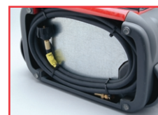
Hose Storage Bay Accommodates Up To 12 ft. Hose Assembly

Also operates with optional hose extensions and fuel filter for 20 lb. cylinder.