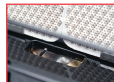
Low Oxygen Shutoff Pilot Safety System