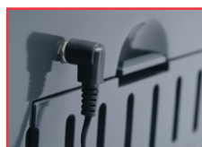
Uses A/C Adapter Or 4 D-Cell Batteries To Power Blower Fan