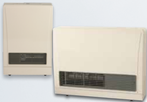
EnergySaver Direct Vent Wall Furnace (T Series)