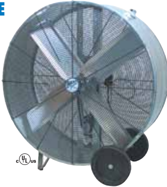
BF48BD also available in red.