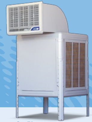
CoolView Ground Mount Window Cooler (Models: GMA 30/50 & GMR 30/50)