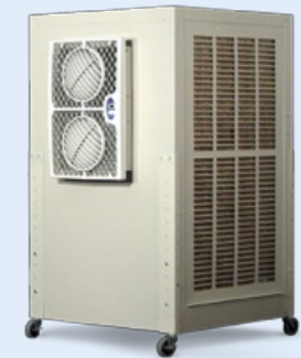
CoolTool - CTV2 Multi-use Evaporative Cooler